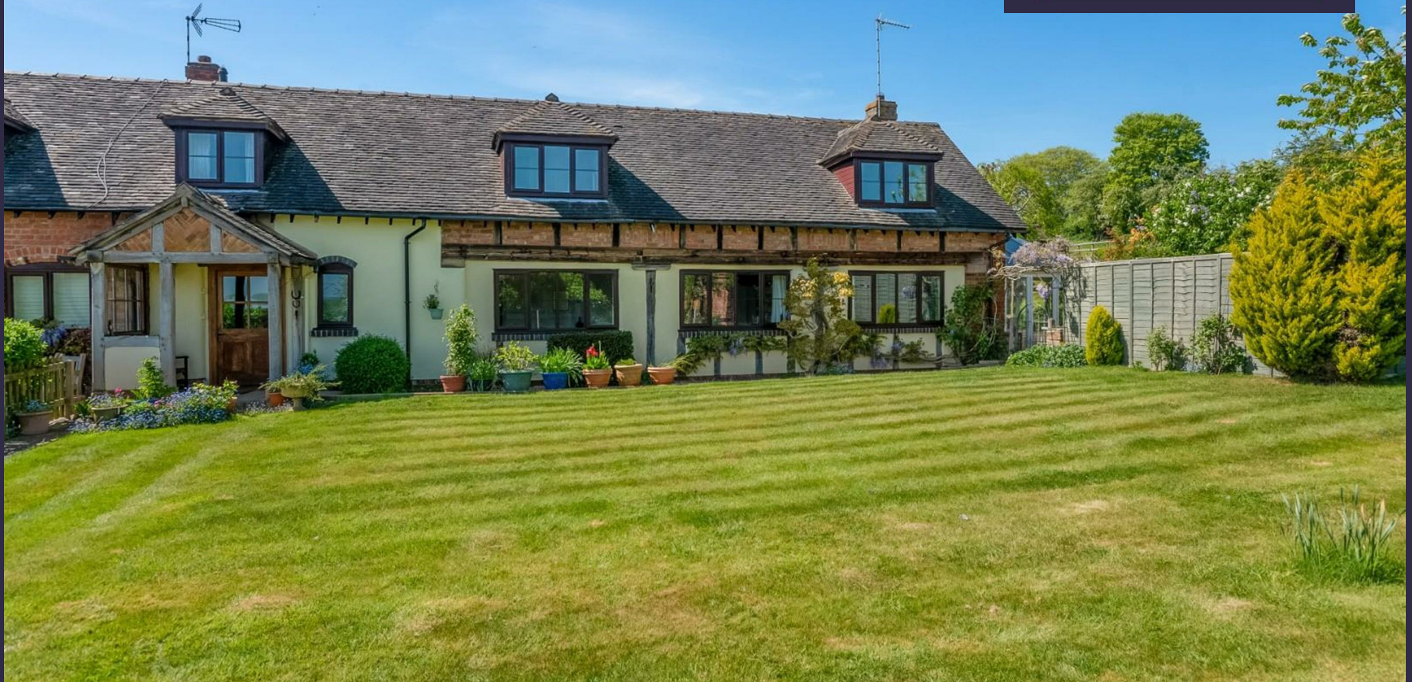
Meadow Barn, 4 Meadow Farm, Wolverton, Stratford-upon-Avon, CV37 0HG